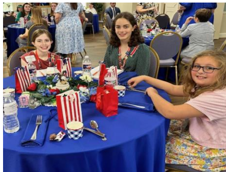
State Board Meeting