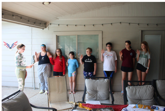
Officer Installation at June Meeting