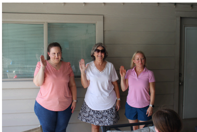
Senior Officer Installation at June Meeting